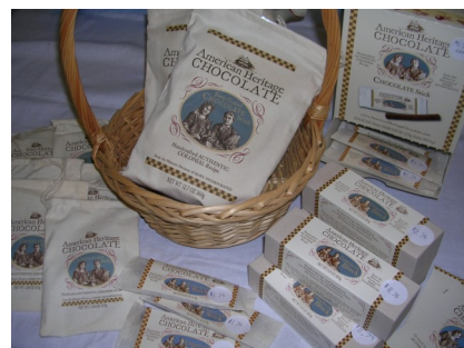
American Heritage Chocolates