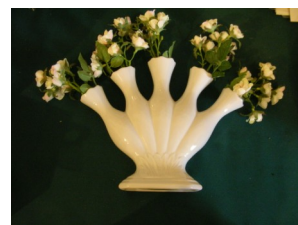
White five-finger vase

For more details on these and other products, visit the shop at www.joellane.org or come by the Visitors Center.