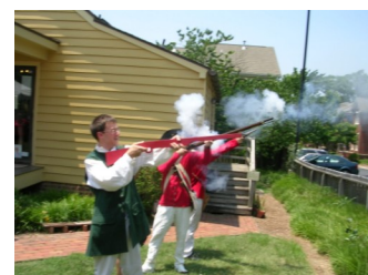
Drilling & Firing on July 4

"Slavery in Microcosm: Bertie County, NC, 1790-1810 "