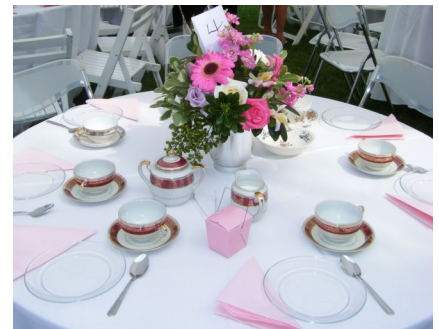
Lavish Table Settings at Lizzie Lane's Colonial Tea